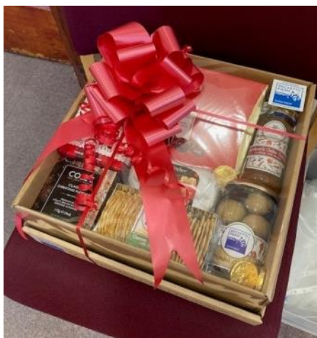
A Christmas hamper, kindly donated by Becketts Farm

A sincere thank you to everyone who donated a prize, and special thanks to Irwin Mitchell for the £100 Amazon gift voucher, Sharp Business Systems for the printer and the Coventry City FC tickets and Pure Cloud Solutions for the Birmingham City FC tickets.