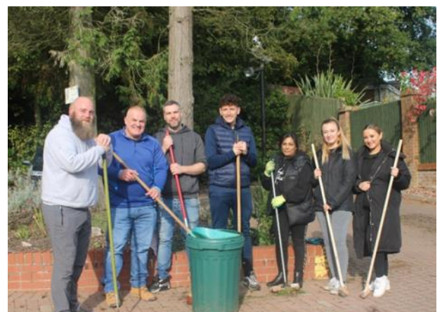
The first team from V12 stop work to pose for a quick photo!